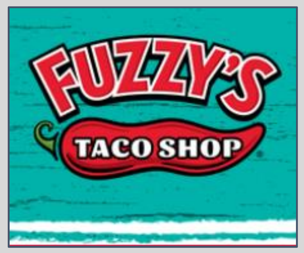
Fuzzy's Taco Shop 7425 W. Adams Ave Suite 100-120 Temple, Texas 76502