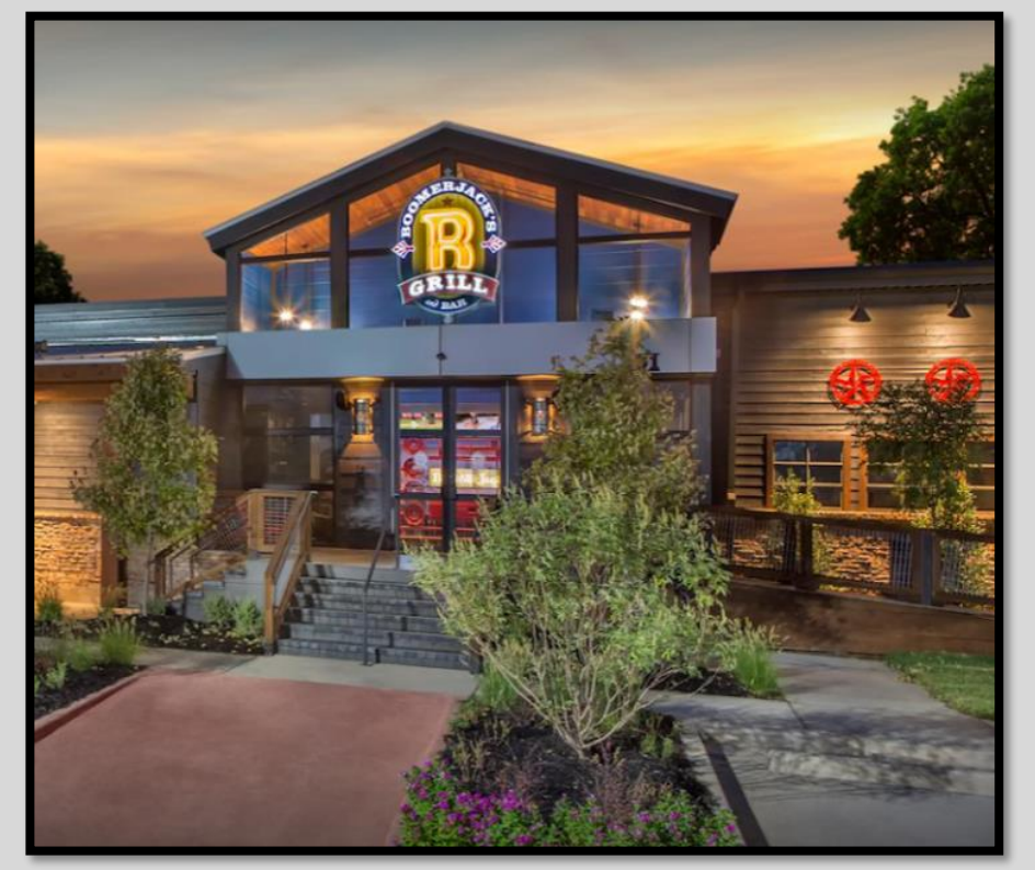
Boomer Jack's 201 W State Hwy 114, Grapevine, TX 76051