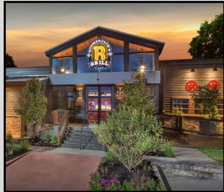
Boomer Jack's 201 W State Hwy 114, Grapevine, TX 76051