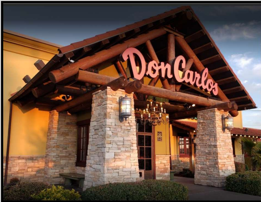
Don Carlos 4651 Interstate 35 South, Waco, TX 76705

July 24 11:00 am – 1:00 pm Club Social Events