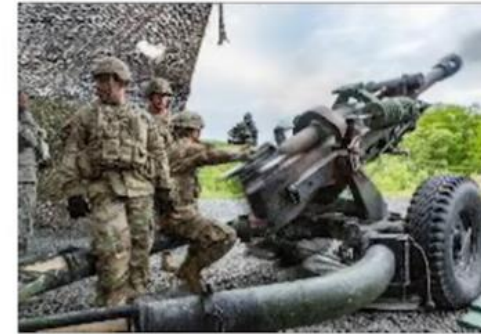
Call for Fire (105mm)