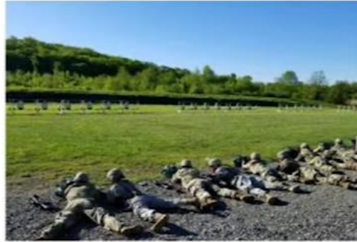
Basic Rifle Marksmanship