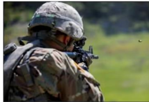
Basic Rifle Marksmanship