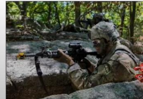
Field Training Exercise (FTX)