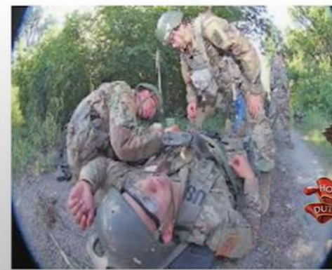
Leading Under Stress