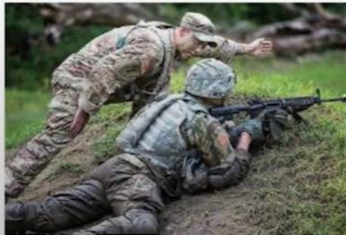
Buddy Team Live Fire