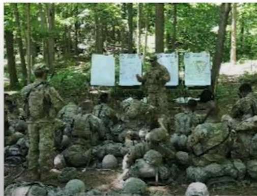
Troop Leading Procedures