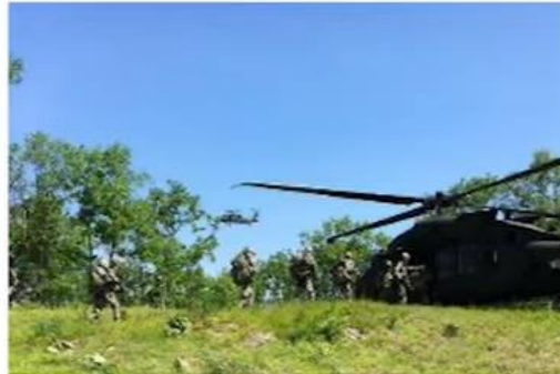
Air Assault Infiltration