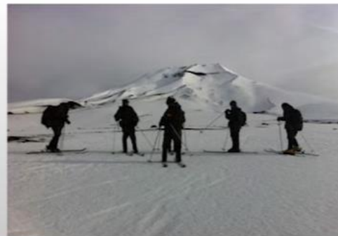
Chilean Mountain School

*Many MIADs reduced or canceled for CST 21 because of COVID